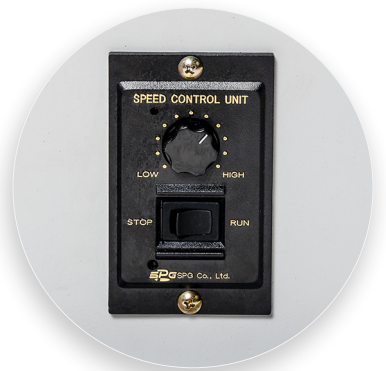
Control the speed of the conveyor belt with the turn of a dial.