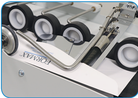
Precision moistening roller and flap closing bar accurately seal stacked or nested envelopes in a single pass