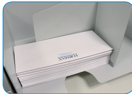
Adjustable outfeed tray accommodates a wide variety of envelope sizes, keeping them neatly stacked after sealing