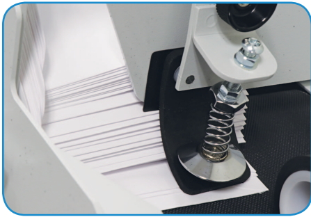
Envelope separator ensures single feeding

Options: FD 430-10 Extended Sealing Kit for flaps up to 4" long, FD 430-20 Square Flap Moistening Basin and Roller