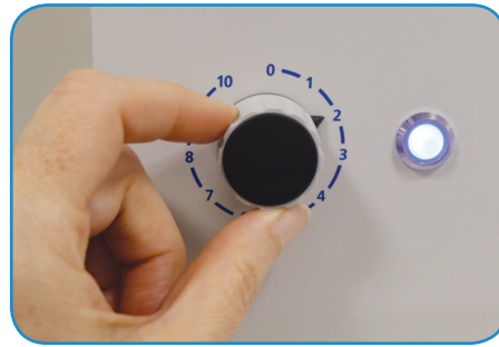
Variable speed control knob