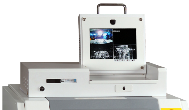
Camera Monitoring System, Displays and records real time feeding and destruction of gaming materials.

1-Year Warranty on cutting head and all other parts