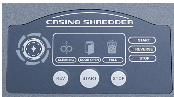
User friendly LED control panel displays real-time shredding status