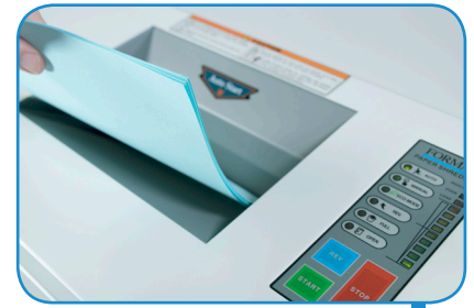
Separate infeed for paper, and user-friendly LED control panel

* Paper Shredder is designed ONLY for paper. No CDs, DVDs, Blu-ray discs, credit cards, staples, or paper clips.