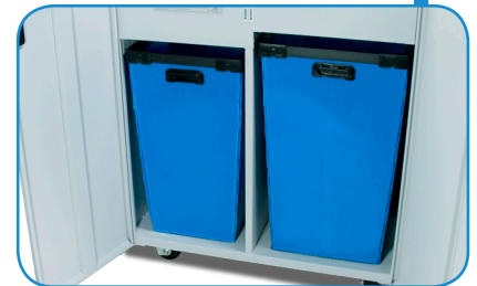
Lifetime guaranteed waste bins made of heavy-duty molded plastic