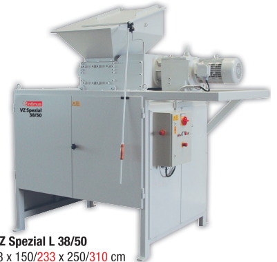
intimus VZ Spezial L 38/50 W/D/H 243 x 150/233 x 250/310 cm