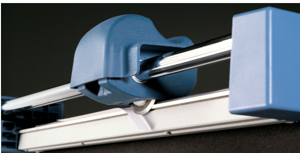
Special sharpened carbon steel blade to cut high thickness of paper