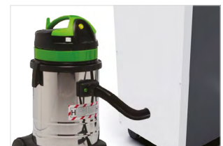
DCS-500 COMPLETE DUST COLLECTION SYSTEM to provide dust free padding mats.