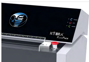
REMARKABLE TOUCH SCREEN PANEL