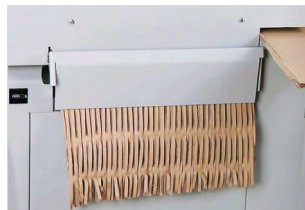
ADJUSTABLE CUSHIONING VOLUME OF HARD CARTON