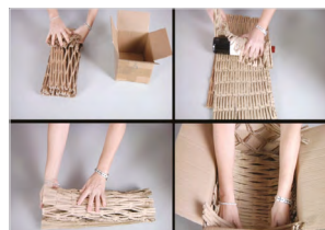
PADDING MATS FROM CORRUGATED CARDBOARDS compressed filling material for secure deliveries of difficult to pack and/or heavy items.