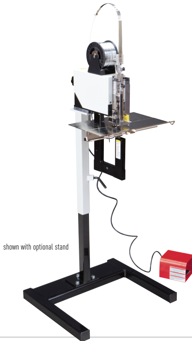
shown with optional stand

Dimensions (D x W x H): 15 x 16 x 24 inches, Shipping weight: 50 lbs.